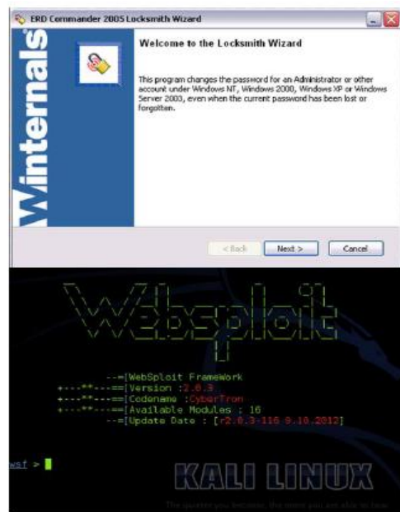
Fig 5: Emergency Rescue Disk

Hence running ERD and using password recovery will automatically crack password.