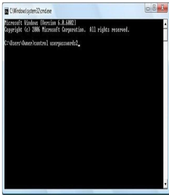
Fig 3: Command Prompt

Then the following screen appears from which the password can be reset: